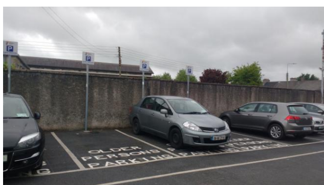
Spaces at St Mary's Car Park