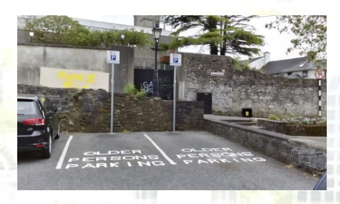
2 Spaces at the Black Abbey Car Park