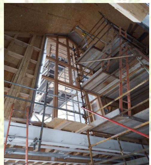
Timber screen at entrance to Kilkenny Room from Lobby.