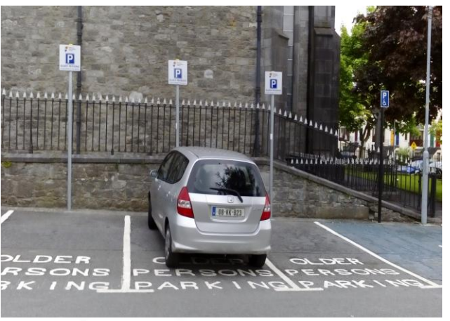
4 Spaces at St Canices Car Park