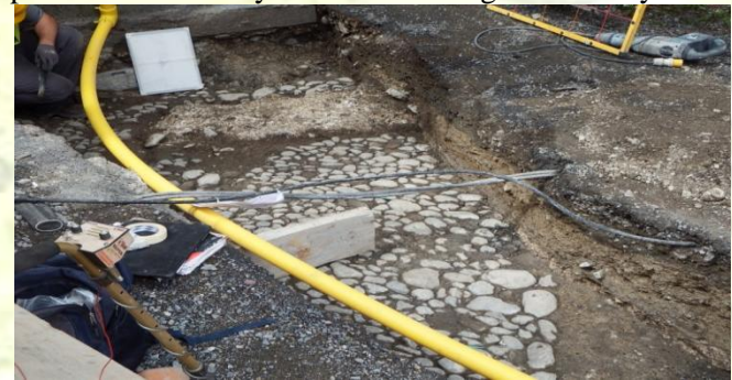
Medieval cobbled surface, indicating pathway.

Proposal for Management of Museum will be presented to County Council Meeting on 18<sup>th</sup> July.