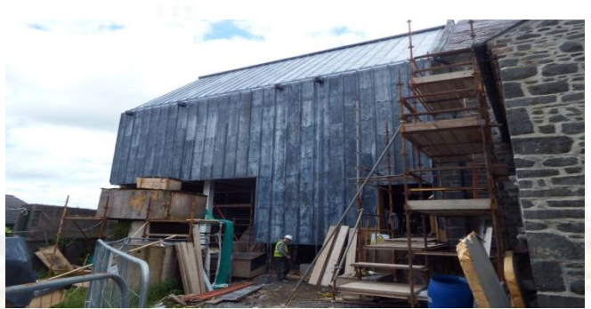
Kilkenny Room, northern elevation with scaffold removed