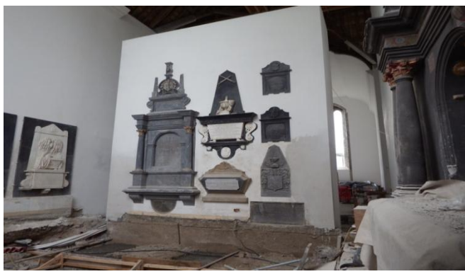
Monument wall painted and scaffold removed