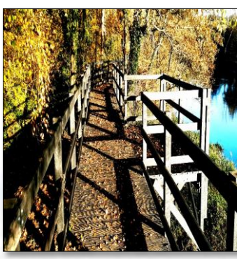
Silaire Wood Boardwalk