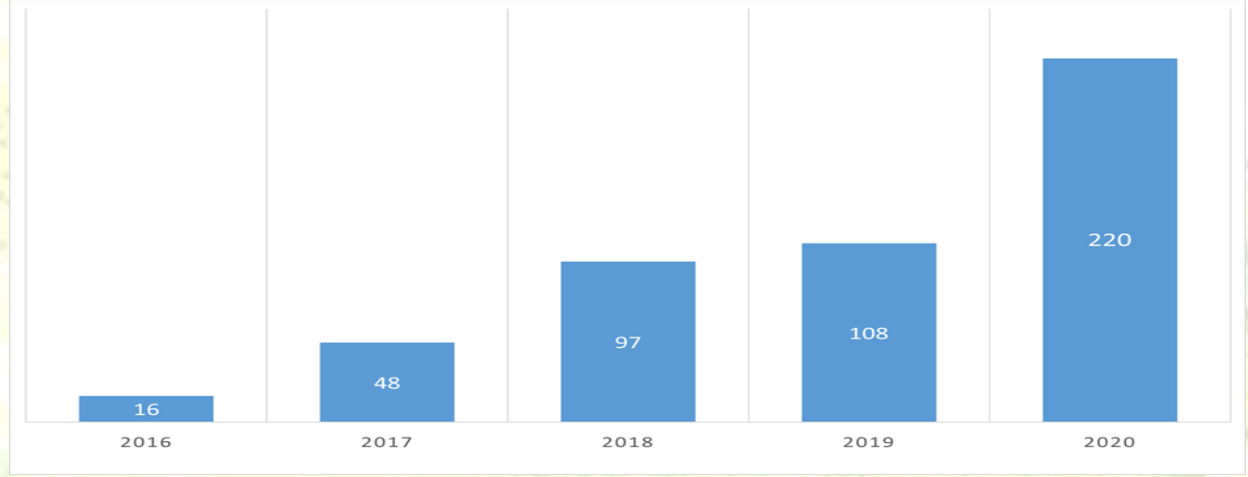
Trajectory of Litter Fines issued from 2016 to date 2020

Despite the restrictions imposed due to Covid-19, our Enforcement Officers remain very active on the ground and a total of 220 litter fines have been issued this year to-date.