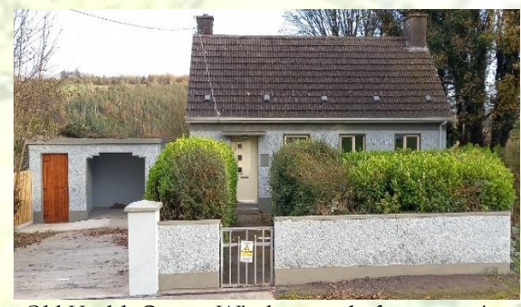
Old Health Centre, Windgap ready for occupation