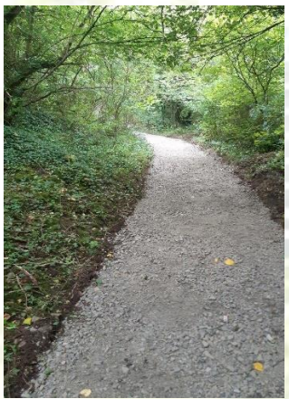
Brown's Wood, Freshford - Before & After

Of the two ORIS Measure 2 funded schemes which can attract funding up to a maximum of €200,000, plus match funding, works are expected to commence at Poulanassy Waterfall before year Graiguenamanagh end. Whilst in reconstruction of the Silaire Wood boardwalk along the River Barrow along with the rehabilitation of the existing woodland trails is nearing completion and it is anticipated that this wonderful amenity will reopen to the public in December. Apart from the nuts and bolts the new boardwalk is made from 100% recycled plastic, made from a mixture of blended plastic from household items such as bottle caps, plastic film and margarine tubs.