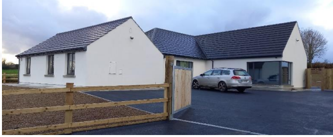
New St.Patrick's Group Home, Windgap, Kilkenny KKVHA project-ready for occupation