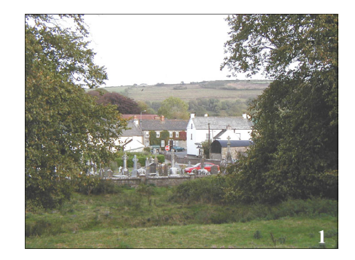
Photo 1: Landscape Context: Glimpse view of village from west side of stream.

The deeper plots on the east side of the street give way to a