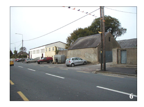
Photo 6: East side of Main Street - opportunities for redevelopment and the creation of more active uses along the street front.

Photo 7: View of old stone bridge and stream that runs along the back of Main Street.