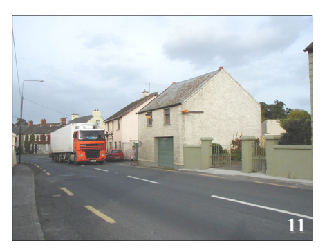
Photo 10 & 11: Intermittent provision of footpaths and exceptionally narrow footpath widths as shown above raise concerns for pedestrian safety. Redevelopment of the above site could see a 'rationalisation' in the building line linking into to the neighbouring site to the north.

Photo 12a: Though the road carriageway is fairly wide, vehicles tend to park on the footpath (west side of street).