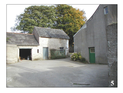
Photo 5: Example of traditional agricultural farmyard to be found on the Main Street.

In addition to the distinctive square shaped tower, constructed of stone, the site of the Church is bound to the east, west and south by small streams and stone walls, which give it its distinctive character.