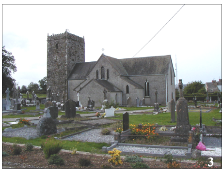
Photo 3: The Church - the village's most significant landmark building.

Photo 4: View south towards village centre - strong urban form.