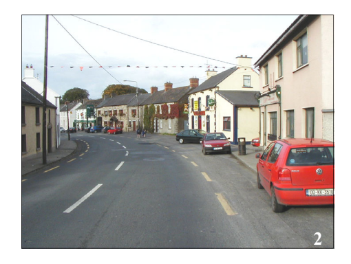
Photo 2: Strong curvilinear form near the centre of the village. Here the street broadens, permitting space for on-street car parking.