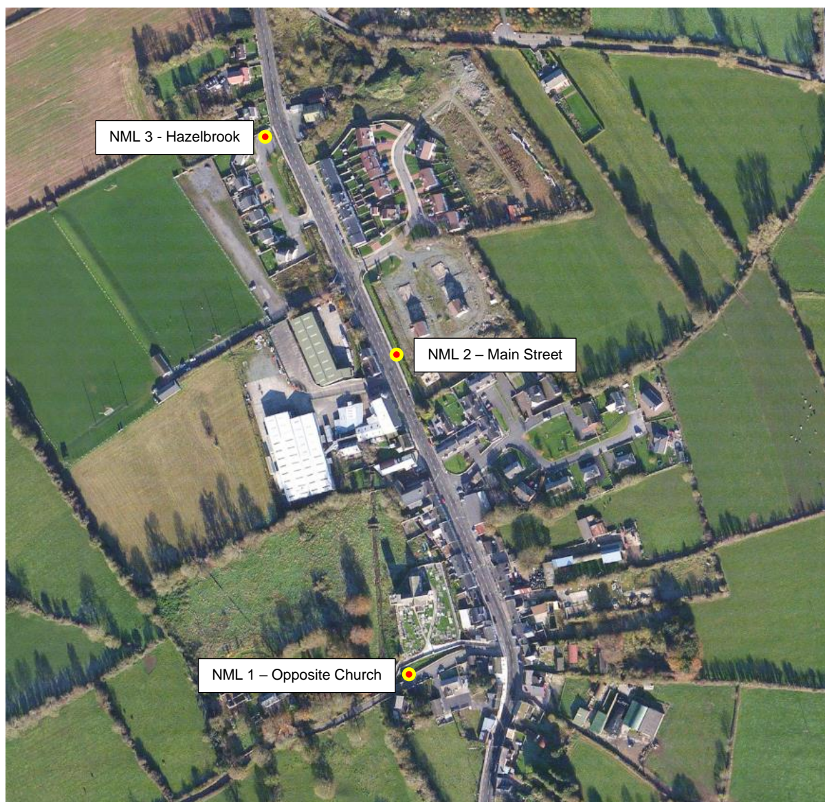
Figure 13-1: Noise Monitoring Locations (NML)