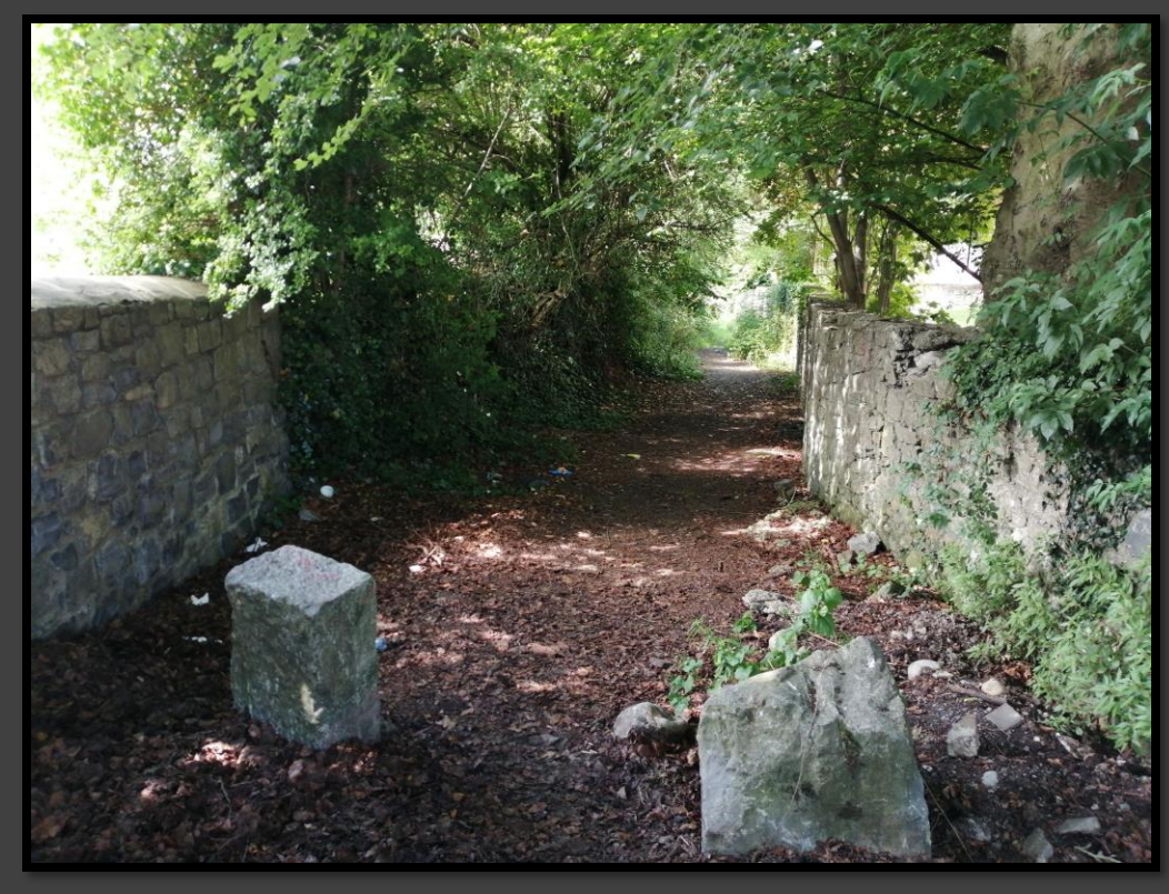
View from Cootes Lane