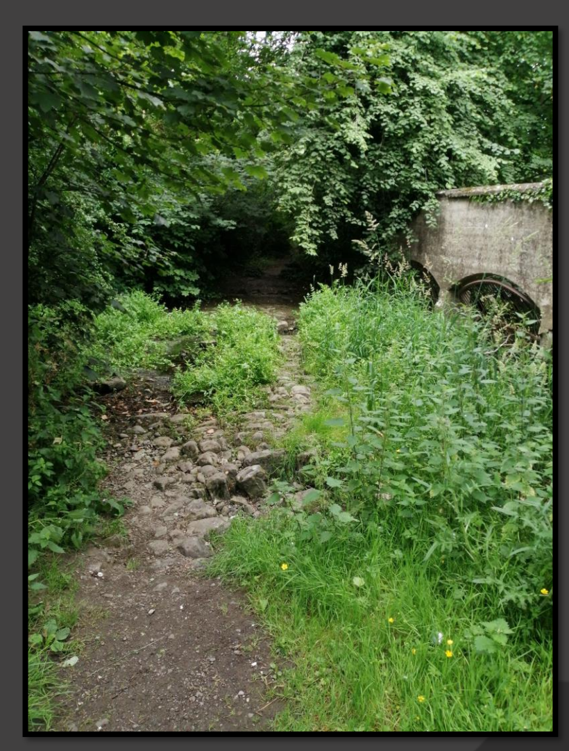
View of ford