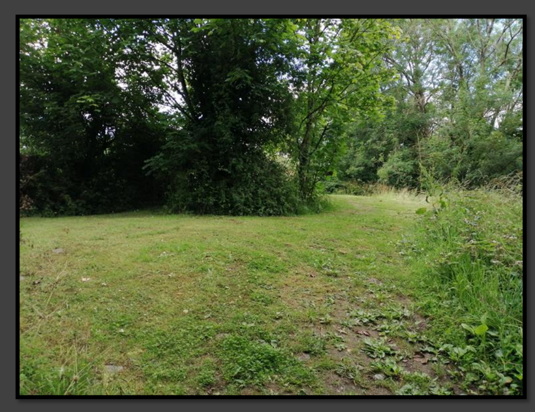
Area between River Breagagh & Ring Road