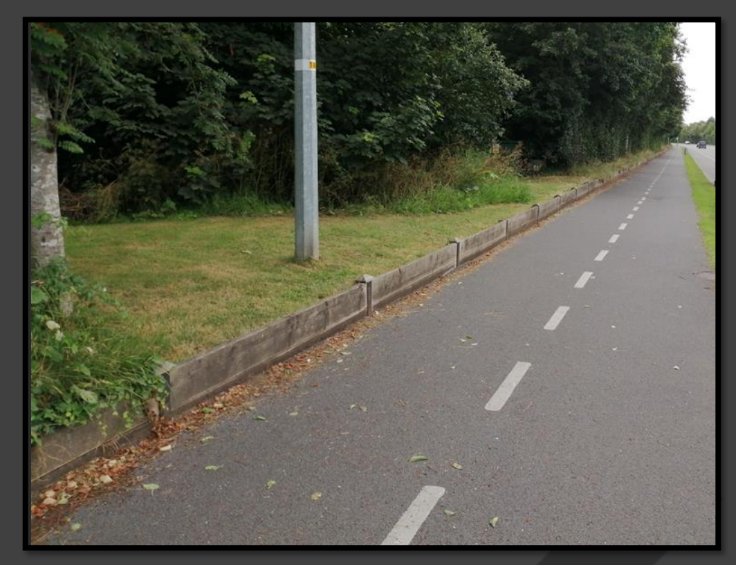
Ring Road footpath & cycle lane