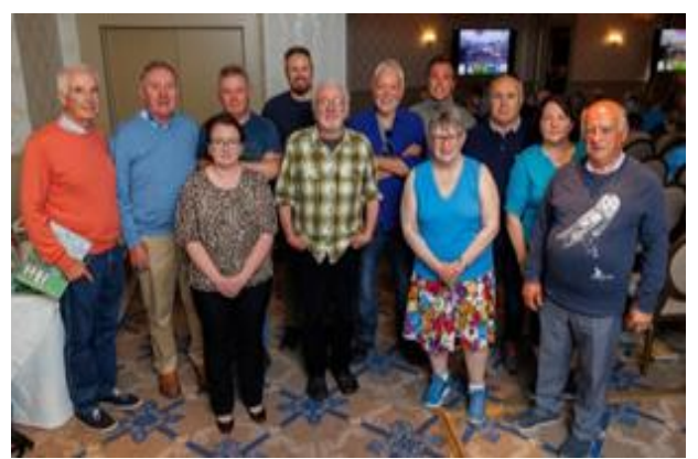
Barn Owl Survey Attendees, River Court Hotel, Kilkenny