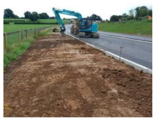
Landscaping works on Link Road