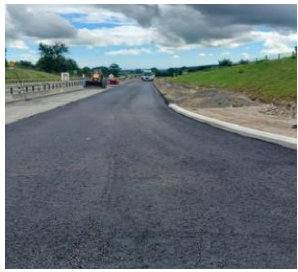
Basecourse works on N24 Main-line

Construction remains on schedule with substantial completion expected by the end of 2023.