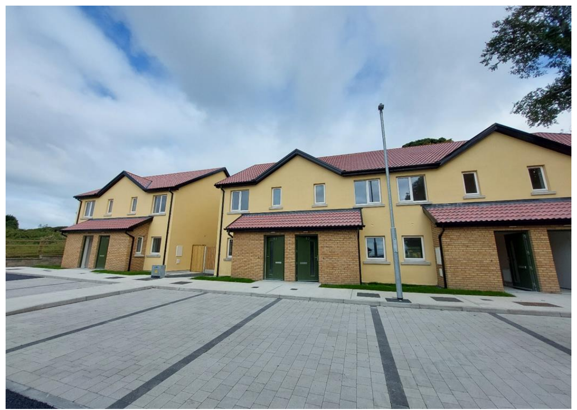
The Crescent, Belmont, Ferrybank