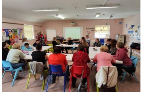
Connect Cafe - Ukrainian Cultural Centre