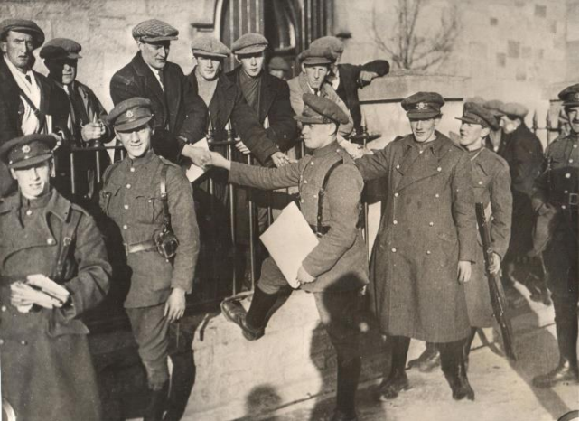
Free State soldiers shake hands with anti-treaty prisoners after the battle of Kilkenny in 1922.