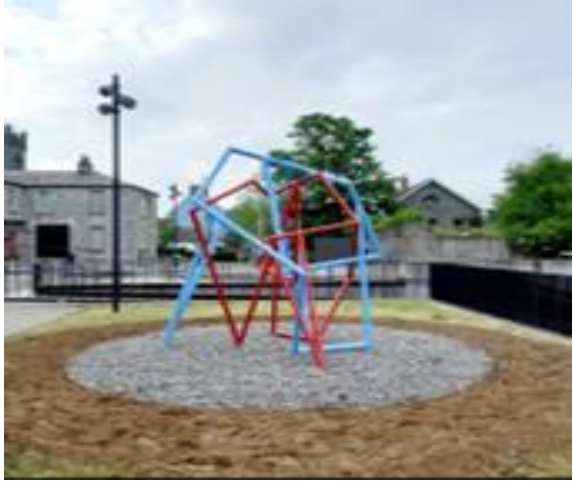
Double Down Sculpture by Isabel Nolan

Gallery site. This sculpture is not a metaphor or symbol, though it will of course be read that way. The public will always adopt and shape the nature of how a work is understood. It's abstract, Generous and as such it will physically activate and interrupt this space in unexpected and odd ways; drawing people in and adding a new dimension to the site by being unfamiliar, beautiful, complex, and uplifting. (Isabel Nolan, Artist)