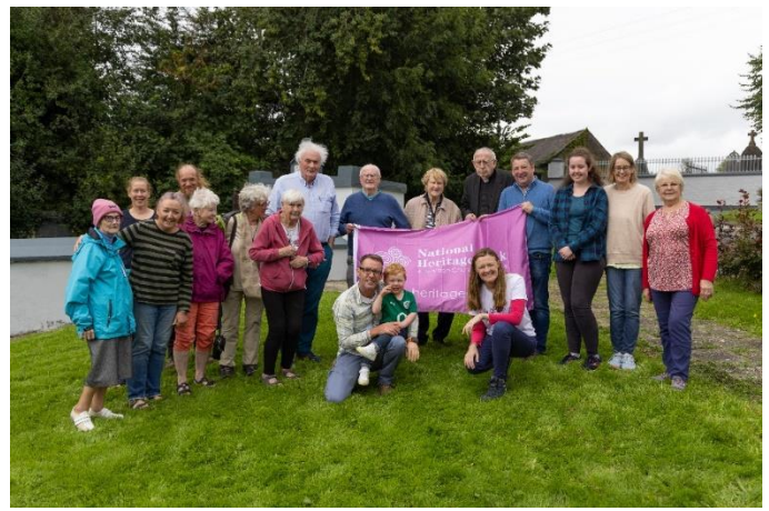
Holy Wells Story Sharing Event, Johns Well organised by Kilkenny County Council Heritage Office as part of the County Kilkenny Holy Wells Survey