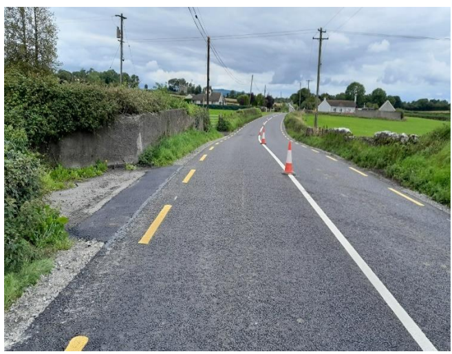
Final Pavement Works N77 Suttonsrath Scheme

The N77 Suttonsrath Pavement Scheme is substantially complete by Priority Construction Ltd. Accommodation works and final snagging are on-going.