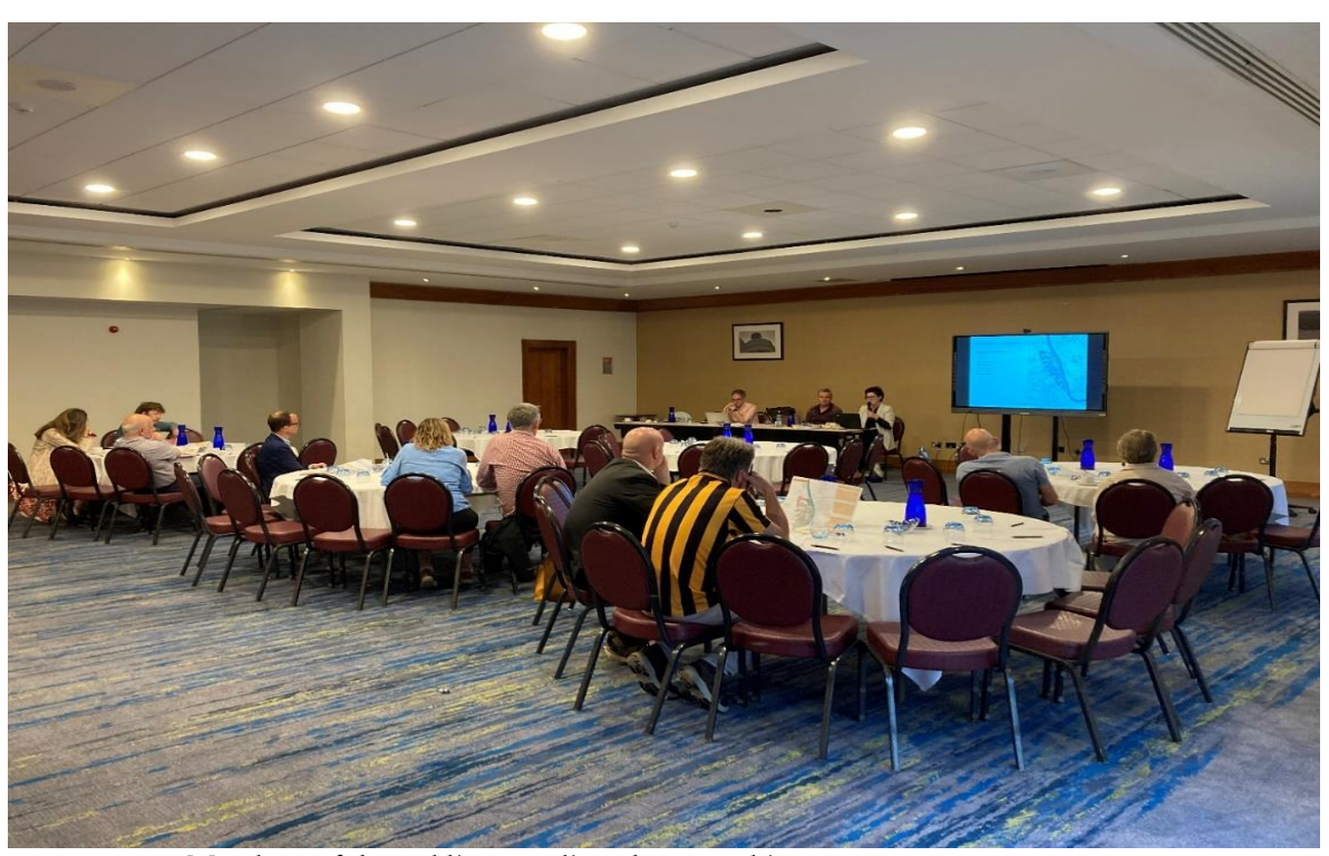
Members of the public attending the second in person event