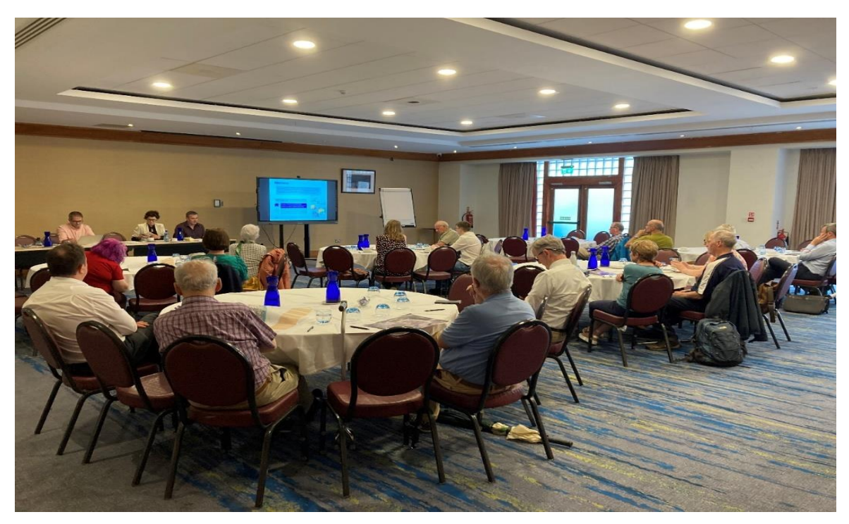
Members of the public attending the first in person event